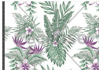
4.0303 V3 - FRANGAPENI SURF