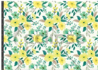
4.0302 V2 - PLAYFUL BEACH