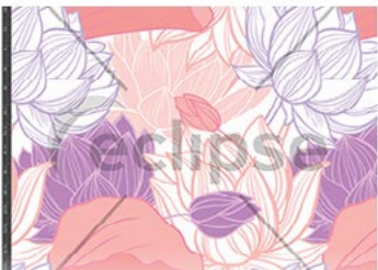
4.0301 V1 - LOTUS