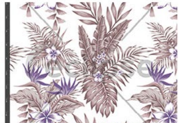
4.0303 V4 - FRANGAPENI SURF