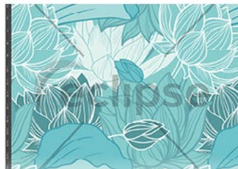
4.0301 V3 - LOTUS