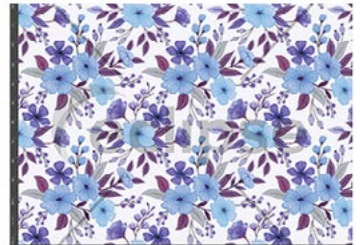
4.0302 V4 - PLAYFUL BEACH