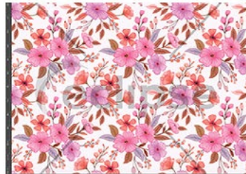
4.0302 V3 - PLAYFUL BEACH