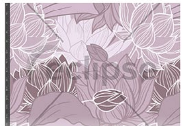
4.0301 V4 - LOTUS