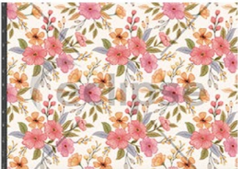
4.0302 V1 - PLAYFUL BEACH