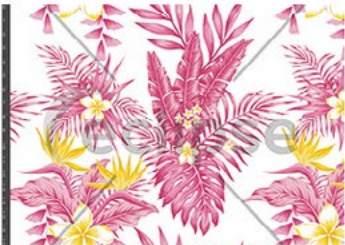
4.0303 V1 - FRANGAPENI SURF

All artwork is prepared for printing based on the required specs ready to go now.