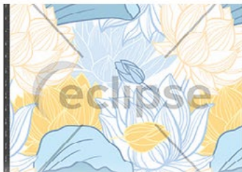
4.0301 V2 - LOTUS