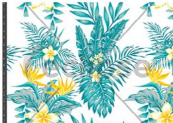
4.0303 V2 - FRANGAPENI SURF